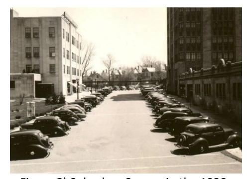
Figure 2) Suburban Square in the 1930s. (Mahan Rykiel Associates)

For those of you not familiar with Suburban Square, it is one of the earliest suburban outdoor malls in the United States. It opened in 1928 and has been going strong ever since, recently expanding to incorporate apartment housing.