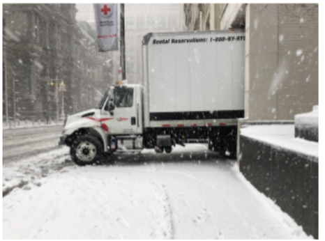
Blocking the sidewalk in a snowstorm, no less.