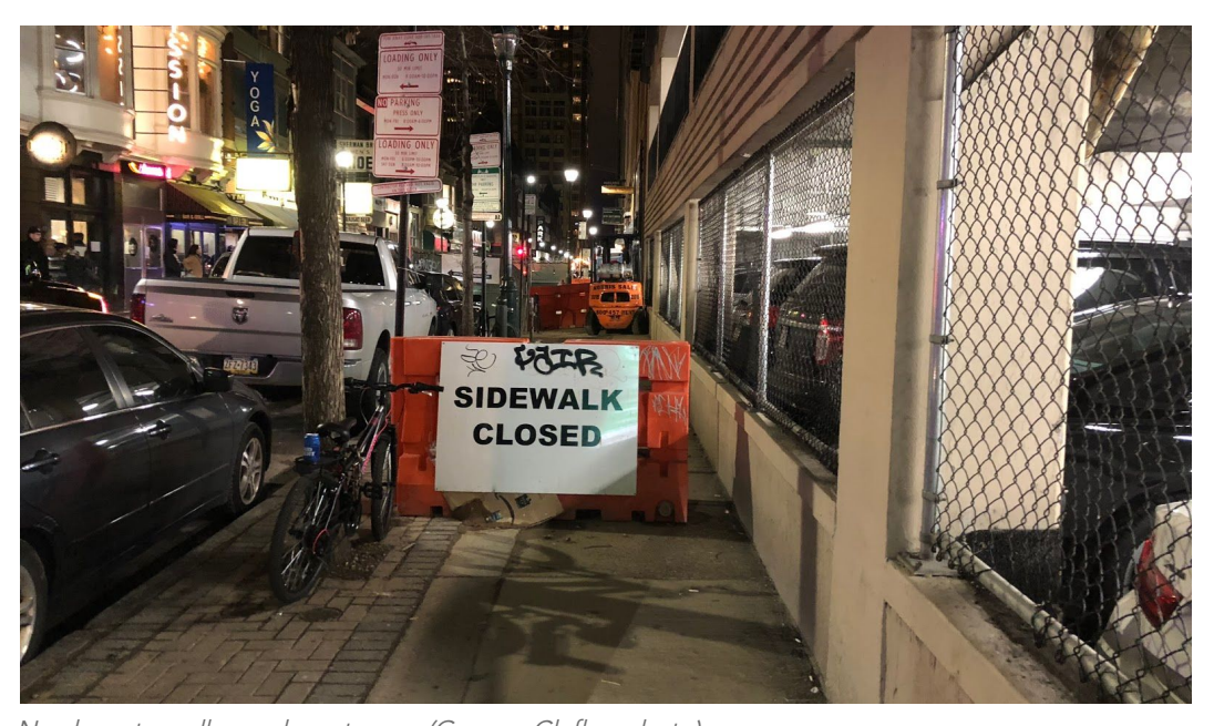
Nowhere to walk, nowhere to run.