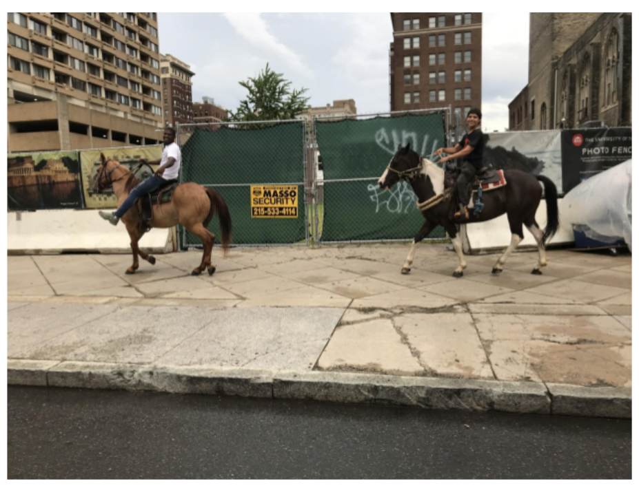
Horses like wide sidewalks, too.