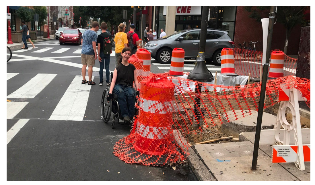
Perilous crossing conditions at 10th and South. Several corners in the neighborhood are similarly blocked.

Those of us fortunate to be able bodied (most of the time) take for granted the ability to navigate uneven sidewalks, cross the street to accommodate a sidewalk obstructed by construction or do an end run around roadwork.