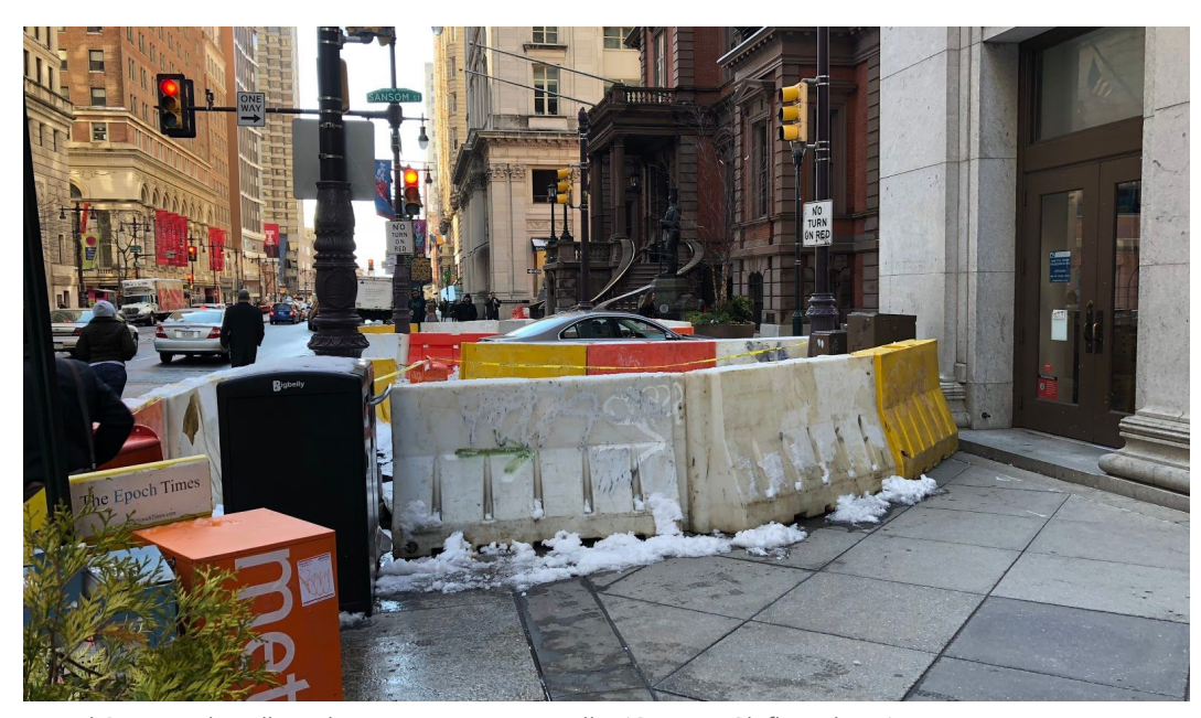
Broad Street sidewalk under construction—totally.