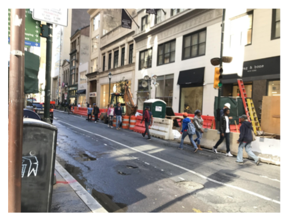
A treacherous stroll down Walnut Street—in the street, September 2017.