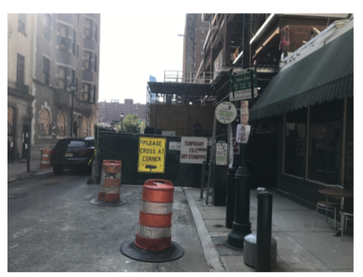
Sansom, one of Philadelphia's picturesque little streets.