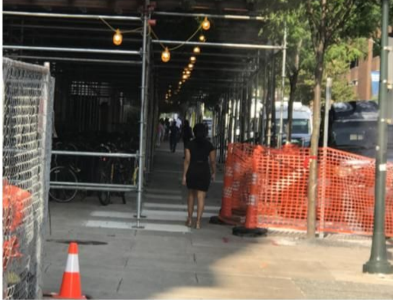
The preferred solution: a "covered" walkway.